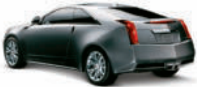
CADILLAC CTS COUPE